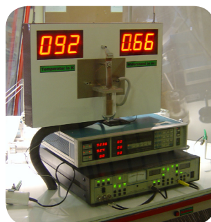
Critical temperature and resistance of a superconductor