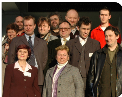
Kick-off conference in Torun, Poland